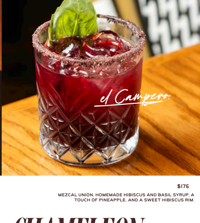
MEZCAL UNION, HOMEMADE HIBISCUS AND BASIL SYRUP, A TOUCH OF PINEAPPLE, AND A SWEET HIBISCUS RIM. CHAMELEON $175