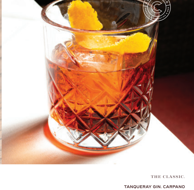
THE CLASSIC. TANQUERAY GIN, CARPANO ROSSO, CAMPARI, AND AN ORANGE TWIST. NEGRONI $190