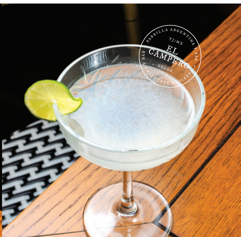
1920S CITRUS MARTINI. WITH A LIME POPSICLE, TANQUERAY GIN, LEMON JUICE, AND SIMPLE SYRUP. GIMLET $170