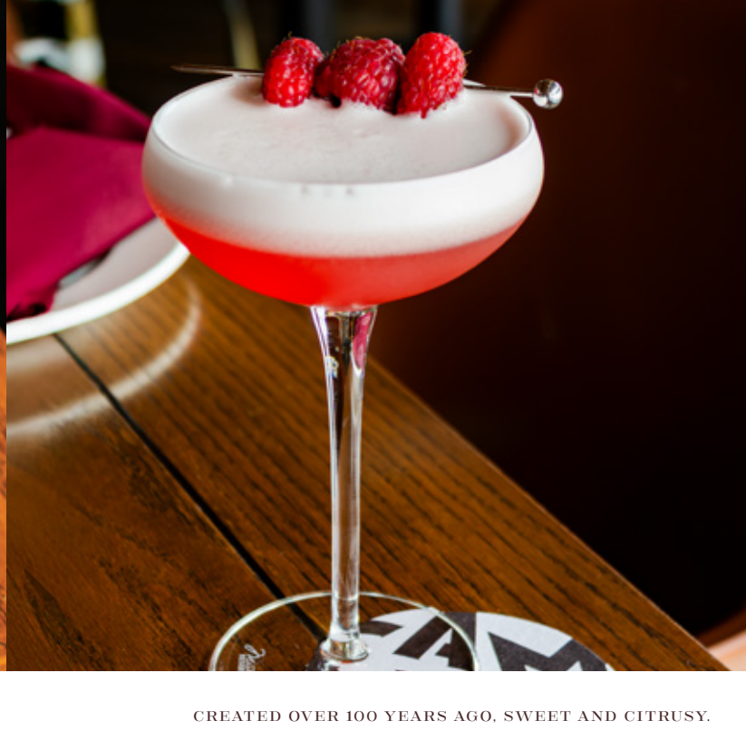
CREATED OVER 100 YEARS AGO, SWEET AND CITRUSY. WITH TANQUERAY GIN, BERRY LIQUEUR, LEMON, AND EGG WHITE. CLOVER CLUB $190