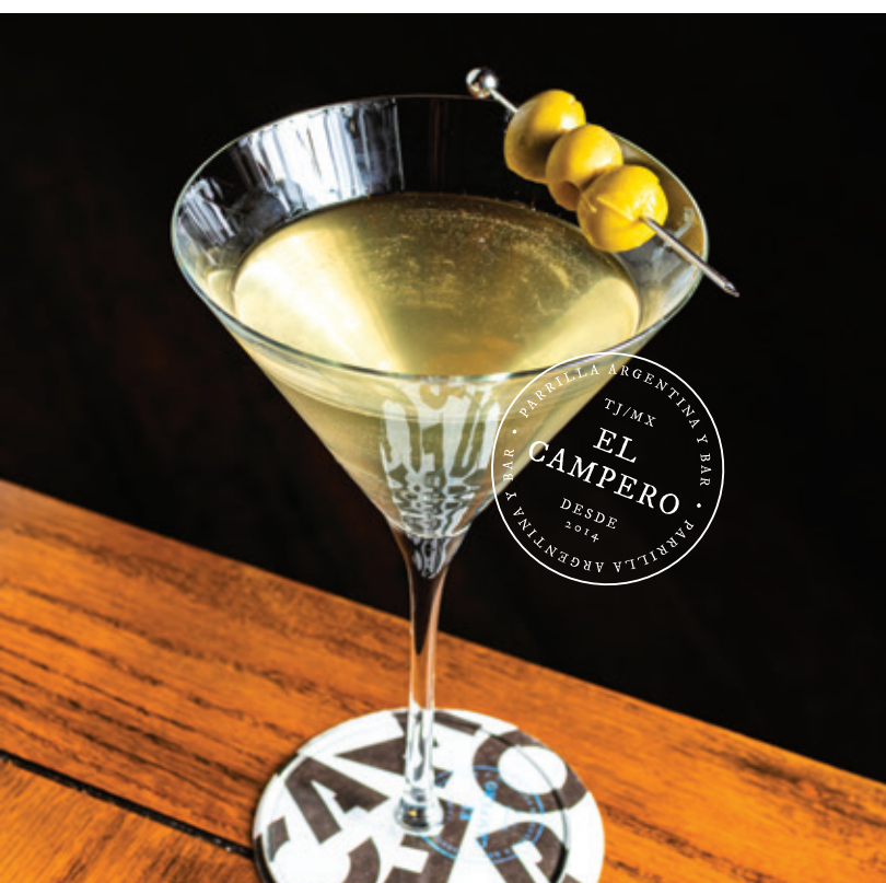
MARTINI $160 WITH TANQUERAY GIN, ORDER IT DRY OR DIRTY.