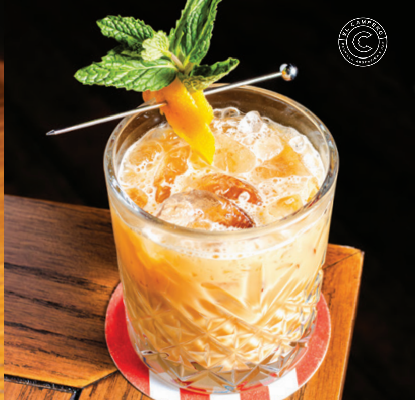
SOMEWHAT WOODY AND SWEET. WITH BULLEIT BOURBON AND DULCE DE LECHE. BOURBON TANGO $170