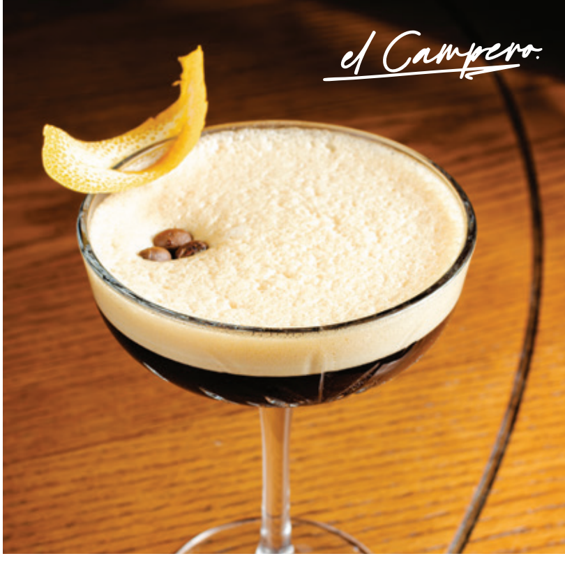
ESPRESSO MARTINI $160 OUR SIGNATURE DIGESTIVE. ESPRESSO, VODKA, AND KAHLUA.