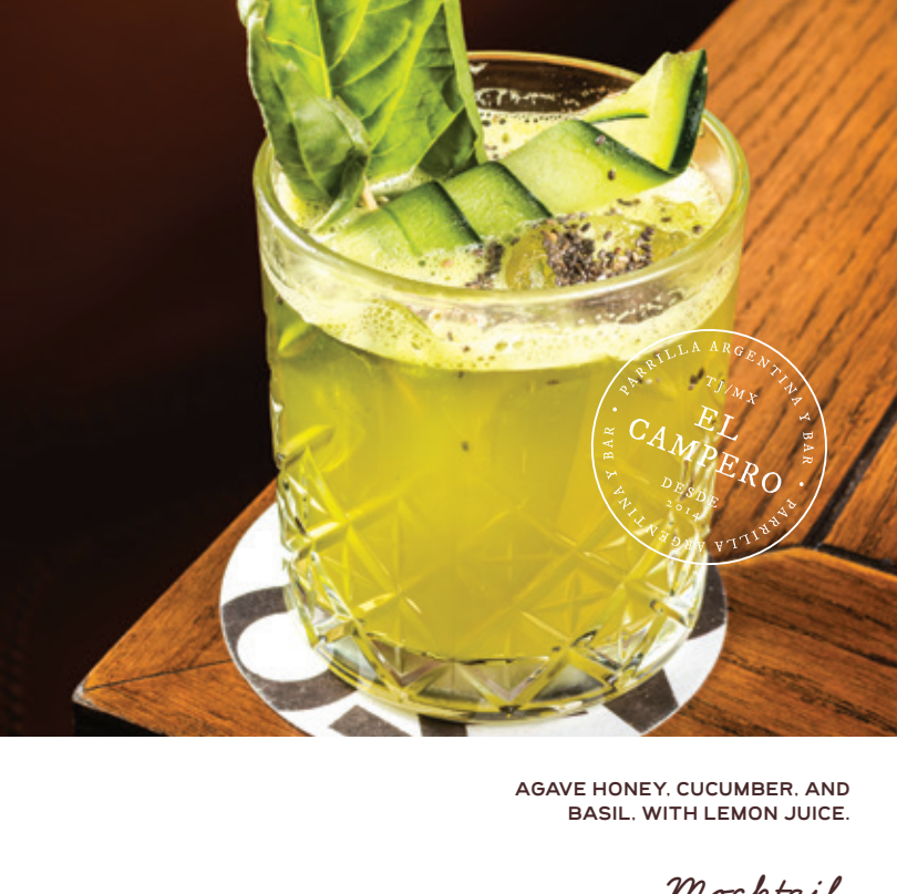
AGAVE HONEY, CUCUMBER, AND BASIL, WITH LEMON JUICE. PEPITO Mocktail $125