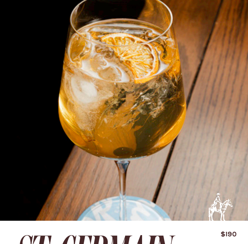
ST. GERMAIN SPRITZ $190 EFFERVESCENT AND SLIGHTLY SWEET. ST. GERMAIN (ELDERFLOWER LIQUEUR), GRAND MARNIER, AND MASCHINO DRY PROSECCO.