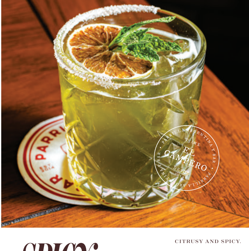
SPICY MARGARITA $170 CITRUSY AND SPICY. WITH BASIL AND JOSE CUERVO TRADICIONAL TEQUILA INFUSED WITH SERRANO CHILI FOR OVER 24 HOURS.