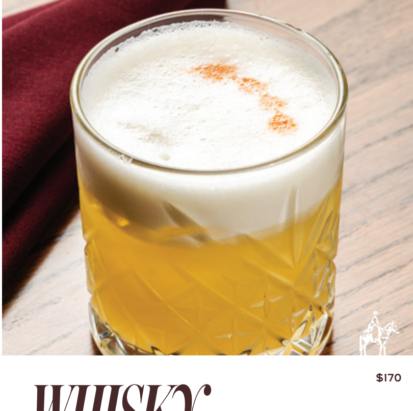
WHISKY SOUR $170 WITH JOHNNIE WALKER BLACK LABEL, ANGOSTURA BITTERS, AND EGG WHITE.