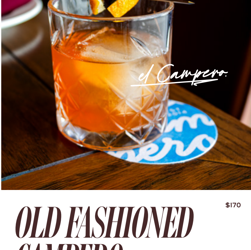
OLD FASHIONED CAMPERO $170 OUR VERSION MADE WITH: MEZCAL AND HOMEMADE SYRUP MADE WITH CRAFT IPA BEER.