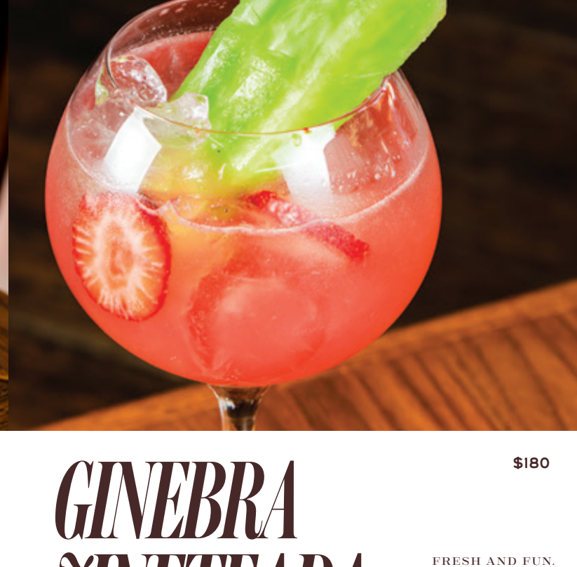
FRESH AND FUN. WITH A LIME POPSICLE, TANQUERAY GIN, RASPBERRY, AND SPARKLING WINE. GINEBRA FINETEADA $180