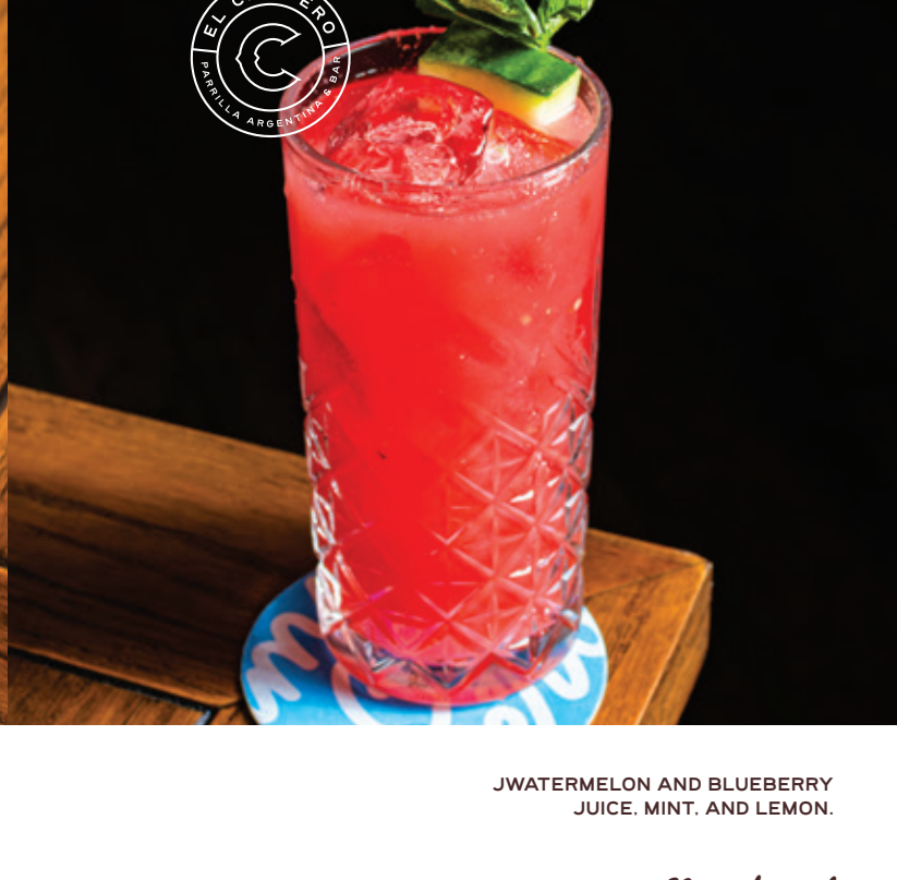
JWATERMELON AND BLUEBERRY JUICE, MINT, AND LEMON. JUBILEE Mocktail $150