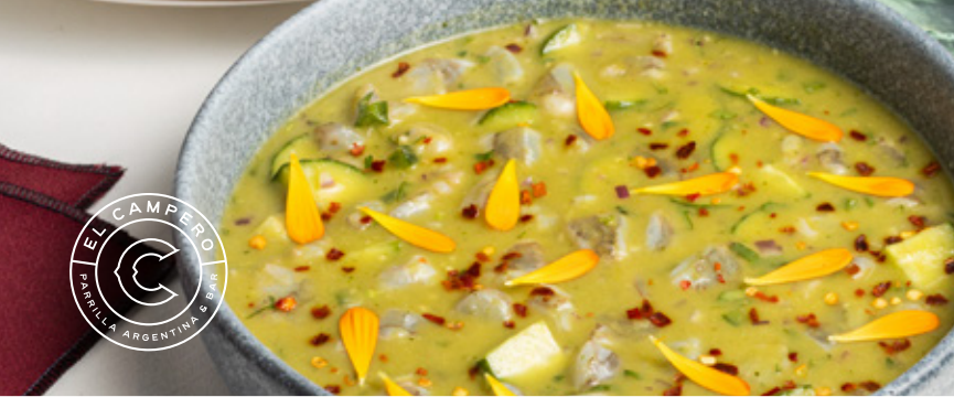
Green Shrimp Aguachile $255