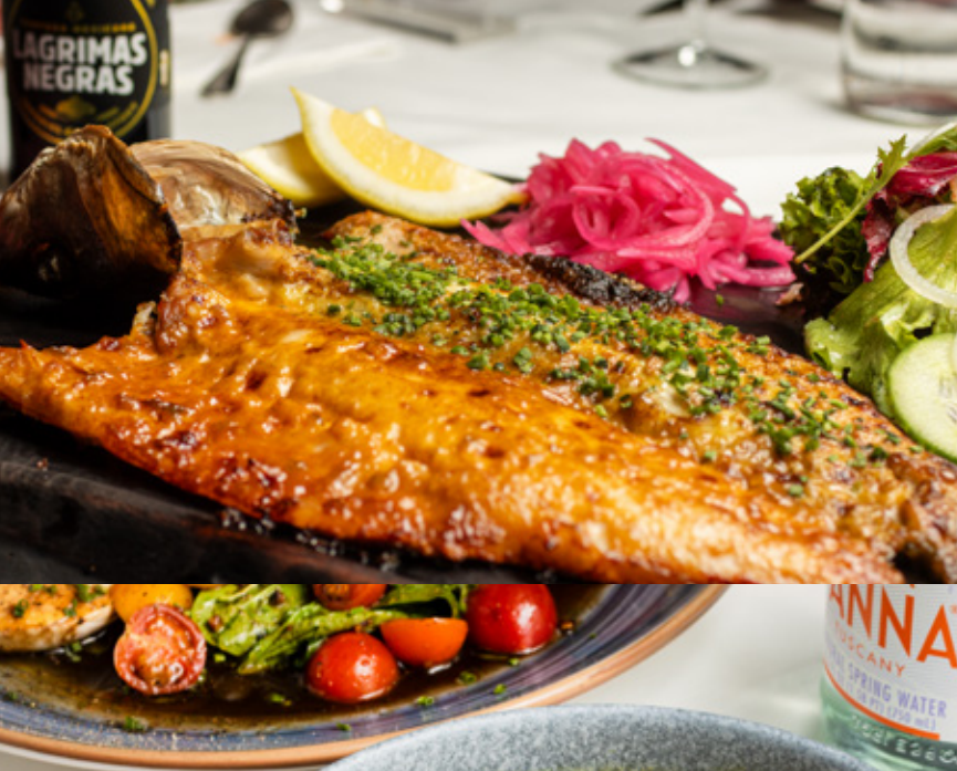
Grilled Branzino $1,400