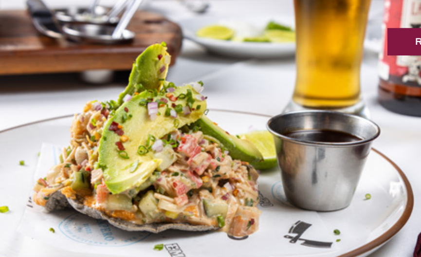
Crab and Shrimp Tostada $190