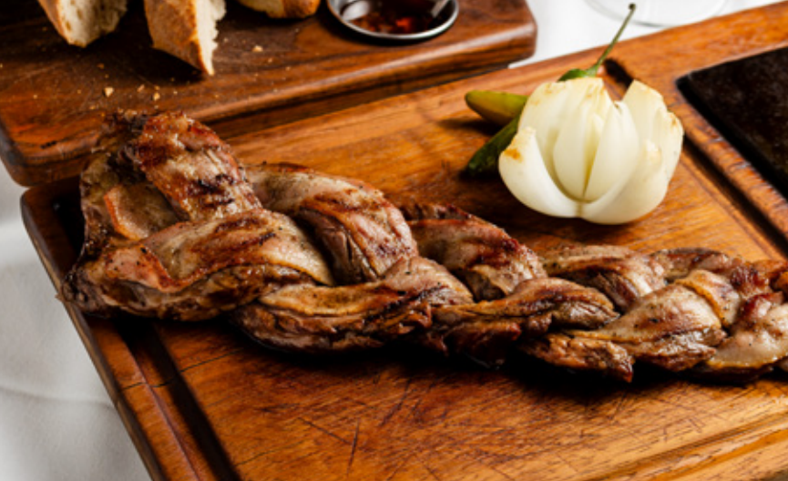
Braided Fank Steak with Bacon $890